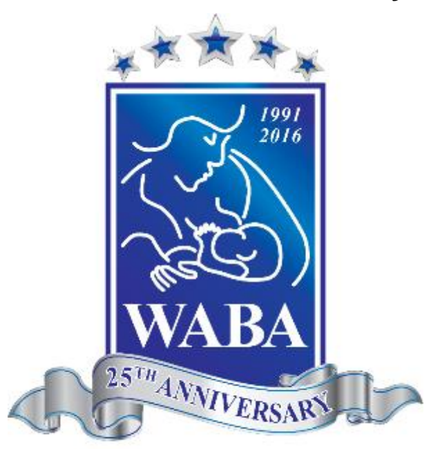
Protect, Promote & Support Breastfeeding Worldwide

25 years ago, in the basement of the UNICEF building in New York the World Alliance for Breastfeeding Action was formed. A year after the Innocenti Declaration of 1990 formally recognised the unique nature of breastfeeding, came the call for concerted global action. So in 1991, a consensus was reached on the need for a global secretariat to coordinate collective efforts.